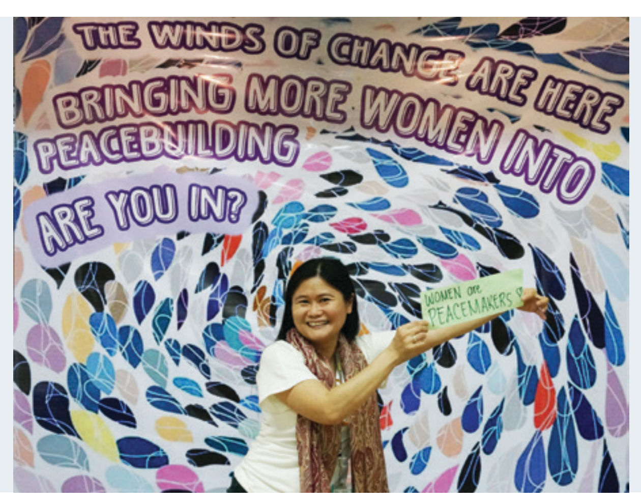
A woman peacemaker from WE Act 1325 in the Philippines participating in the Speak Out For Peace Campaign, which aims to enhance awareness of women's participation in peacebuilding.